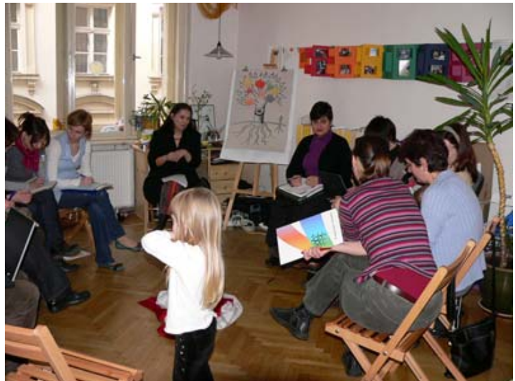
Joint seminar How to start in the office of the Czech Network of MCs = many questions, many explanations