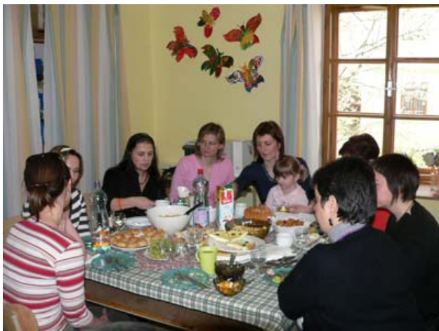
Gustation of “mother-center” cuisine