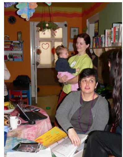
Debate over the chronicle of the 1st MC