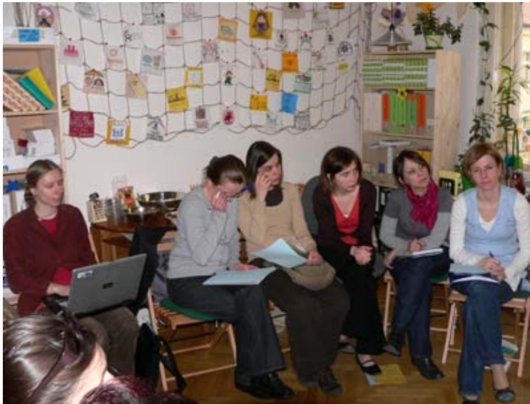
Polish women with an interpreter from Polish-Czech center in a seminar How to start

The joint seminar for Polish and Spanish visitors. Besides oral presentation all participants were given printed materials with the know-how of the Network of Mother Centers “How to start” (Polish women got the materials in Polish, Spanish women in English), so that they could take a compact information package back home.