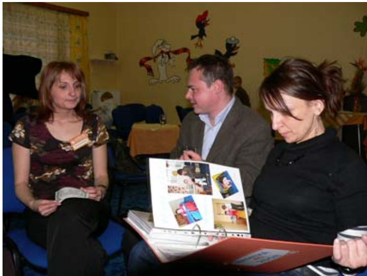
Answering questions, viewing the chronicle of the MC