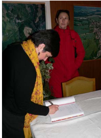
Entry in the chronicle of the MA