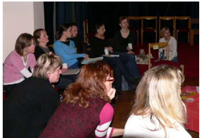
Polish women’s questions were firstly aimed at the interpreter