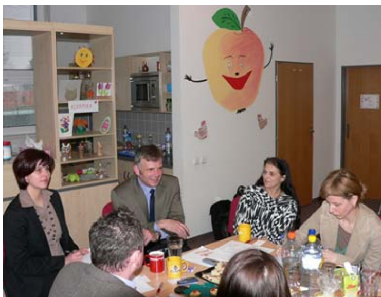
Deputy mayor of Jablonec n.Nisou talks about cooperation and support of the MC so far