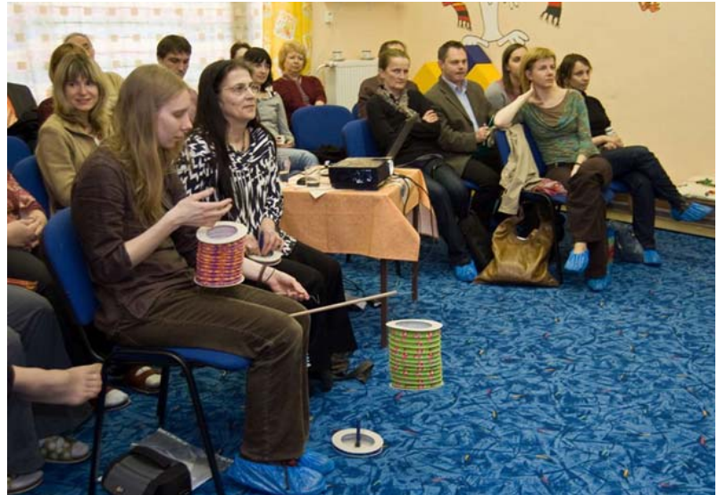
Participants observe the presentation the MC, successful projects and past events