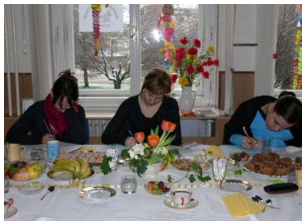
Entering new information on the operation of the MC in the submontane town of Jilemnice