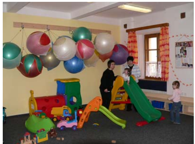
In the playroom with children