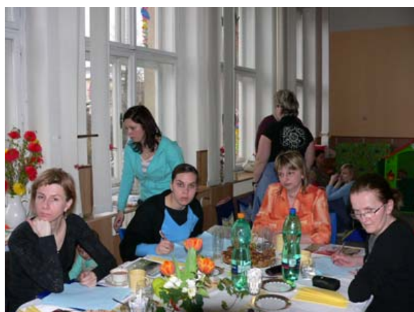
Discussion with the coordinator of the MC at a nicely set table