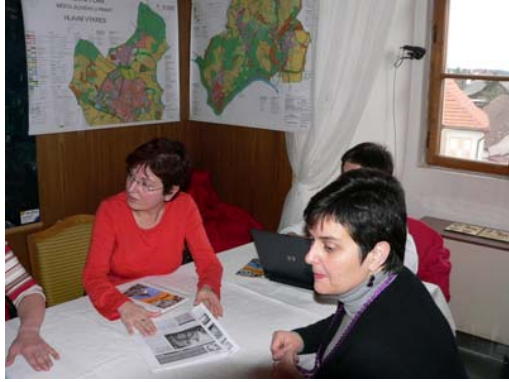
Talk with deputy mayor and town council member on advantages of MC in the town of Jílové and on support of MC from town