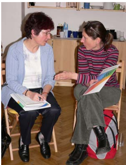
Seminar participants had lots of questions