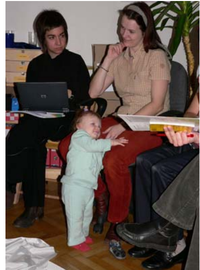
Satisfied mother-interpreter into Spanish