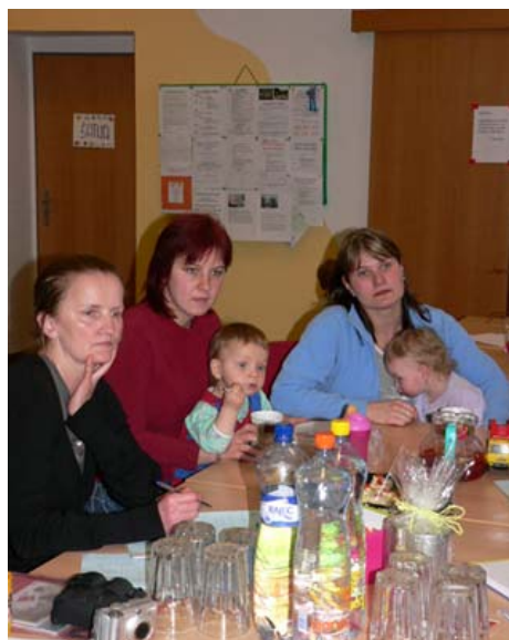
Mothers from the MC presenting the beginnings of Jablíčko